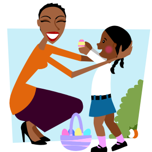
"When it comes to life, the critical thing is whether you take things for granted or taken them with gratitude." GK Chesterton

* Some members have requested there name not be printed in our electronic media.