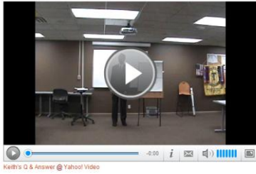
SML! speeches on Internet (Yahoo Video)