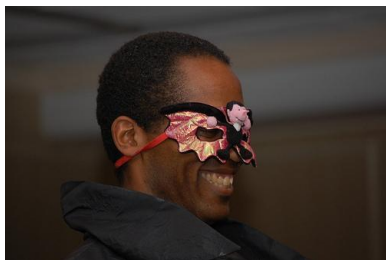
"Friday Fun Night... is always fun.."