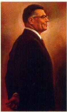
What It Takes To Be Number 1

“The quality of a person's life is in direct proportion to their commitment excellence, regardless of their chosen field of endeavor.. ” Vincent Lombardi