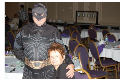
Batman on super secret mission