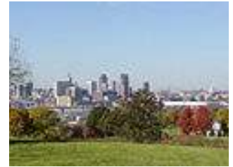
"View of St. Paul from Mounds Park"