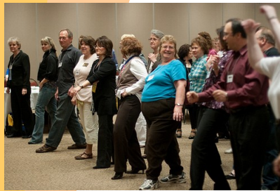
Toastmasters audience participated in the electric slide at Friday Fun Night.